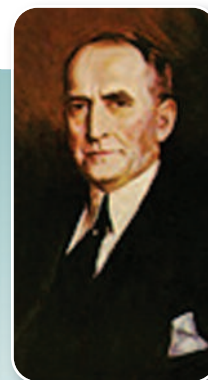
William Bankhead, Speaker of the House (1936–1940)

The 2010 elections saw a 63-seat swing in favor of the Republicans, giving them a majority of 242 members in the House of Representatives. However, the largest majority since Reconstruction occurred after the elections of 1936 when the Democrats had a 334 – 101 majority in the House of Representatives. William Bankhead of Alabama served as Speaker of the House during that Congress.