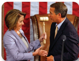
In January 2007, Republican Leader John Boehner presents the gavel to new House Speaker Nancy Pelosi. This situation will be reversed in January 2011.

With the economy and health care reform playing center stage, the mid-term congressional elections provided big gains for the Republican party. A 63-member swing in favor of the Republicans allowed them to win control of the House of Representatives. In the upcoming congressional session, the Republicans will have a 242 – 193 majority.