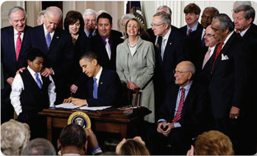
President Obama signing the Affordable Care Act into law in March 2010

The expansion of the Medicaid program contained in the Affordable Care Act (ACA), signed by President Obama in March 2010, is one of the most substantial changes in the health care reform law.